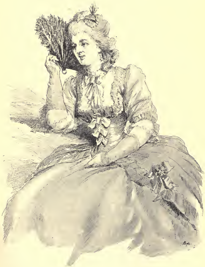
'Mademoiselle O'Fatey' Copyright 1895 by Macmillan & Co.